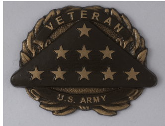
Three inch Medallion